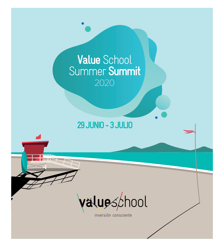
Summer Summit Value School poster.

At Value School, the summer season is synonymous with Summer School and, despite extraordinary circumstances, this year could not be an exception. So Value School Summer Summit 2020 has been launched: an on-line conference circle that is fully open in order to promote financial education and personal development with the participation of national and international experts. Throughout the summer of 2020, the recordings of the talks will be published free of charge for all those who have not been able to attend live.